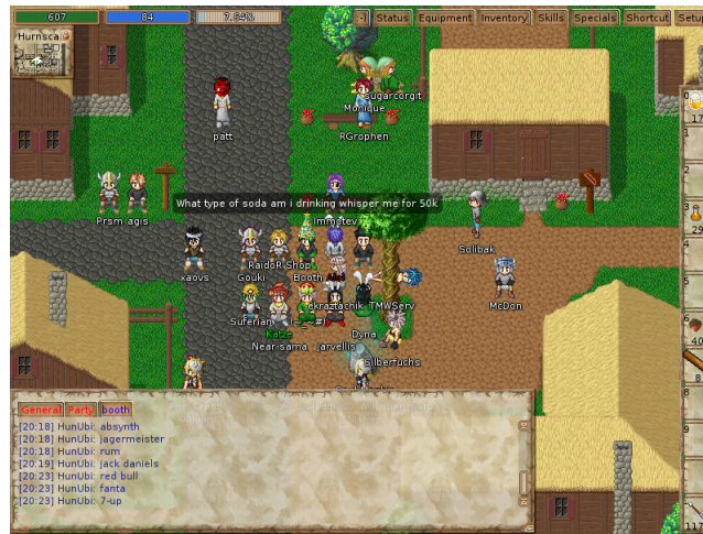
Fig. 2. Open MMORPG: The Mana World