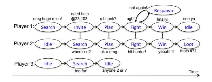
Figure 5: Example of stages in a raid with three players. The horizontal axis represents time. We show the states each player goes through and the messages they exchange. Dashed lines indicate entanglement : two players participating in the same raid.

The nodes and arrows in Figure 5 represent the sequence of states each player goes through. States connected with dashed lines indicate that two players are involved in a common activity (a raid). Note that players don't have to be in