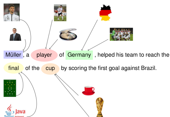
Figure 1: An entity disambiguation problem showing five given mentions and their potential entity candidates.

methods for text aggregation, summarization, and, eventually, semantic understanding. Entity linking is a key step towards these goals as it reveals the semantics of spans of text that refer to real-world entities. In practice, this is achieved by establishing a mapping between potentially ambiguous surface forms of entities and their canonical representations such as corresponding Wikipedia 1 articles or Freebase 2 entries. Figure 1 illustrates the difficulty of this task when dealing with real-world data. The main challenges arise from word ambiguities inherent to natural language: surface form synonymy , i.e., different spans of text referring to the same entity, and homonymy , i.e., the same name being shared by multiple entities.